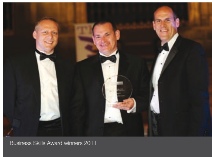
Business Skills Award winners 2011

If you wish to enter more than one category, please visit Energy & Utility Skills at www.euskills.co.uk to download an additional entry form.