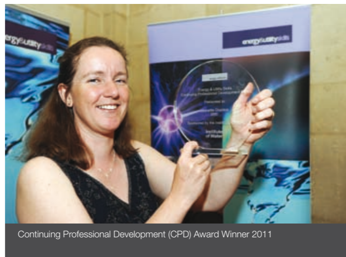
Continuing Professional Development (CPD) Award Winner 2011